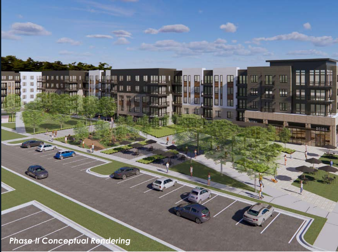
Phase II Conceptual Rendering