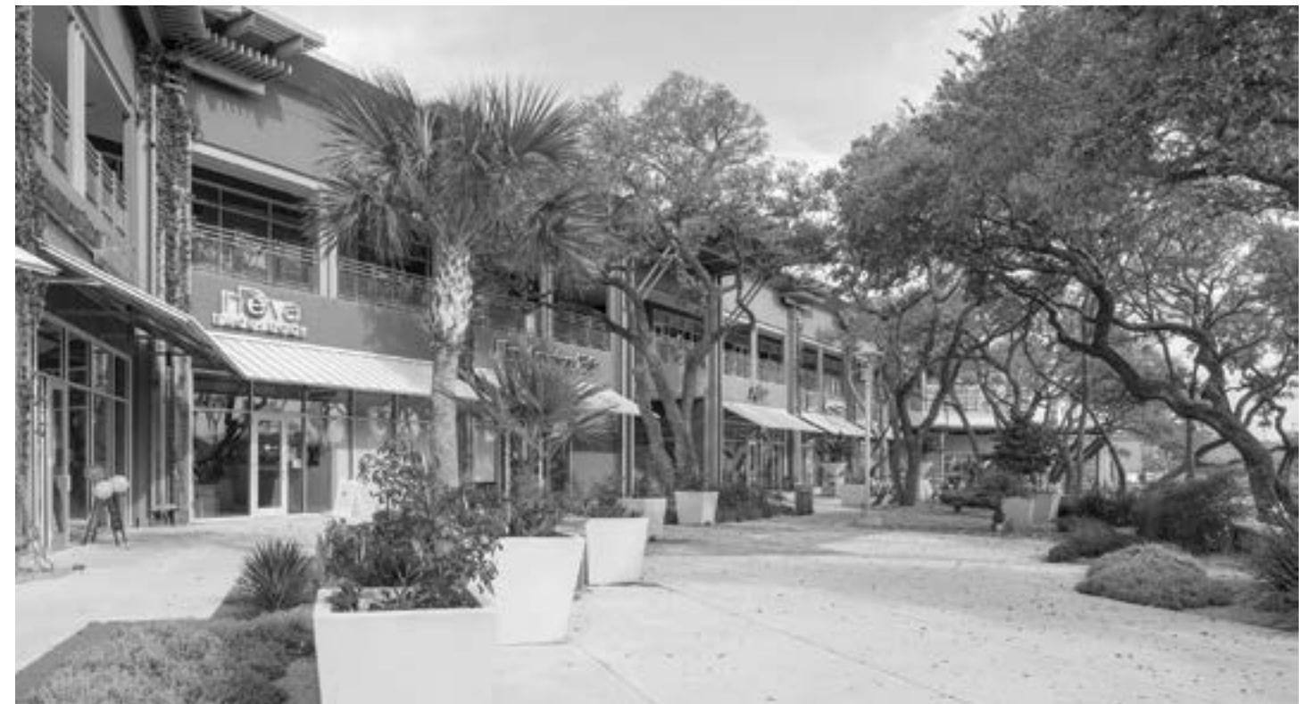
SAN ANTONIO | DOMINION RIDGE