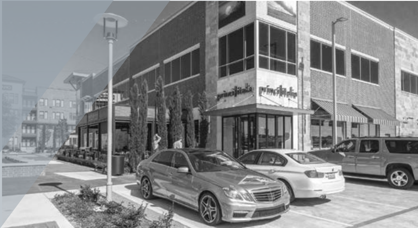
WEST PLANO VILLAGE | D-FW